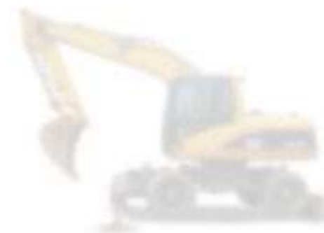
2005 CATERPILLAR 3016C